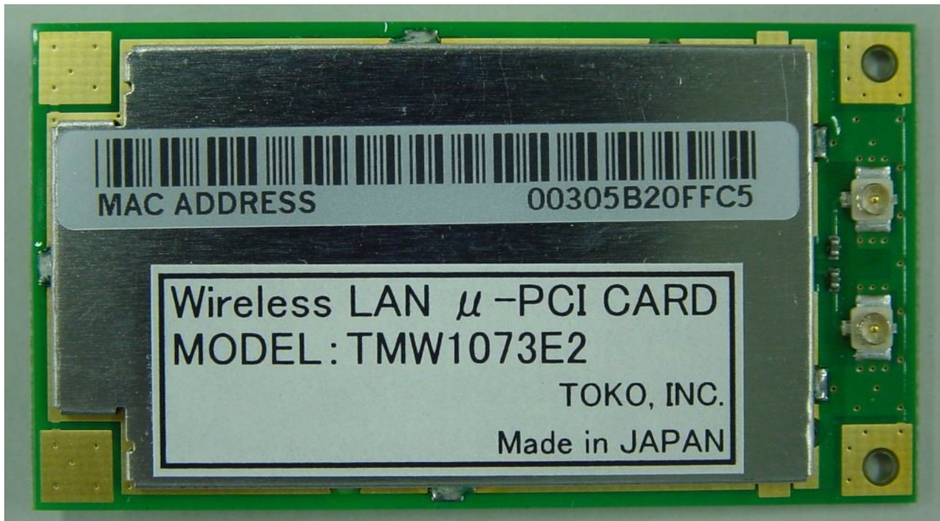
Figure 1 Top View - With Shield