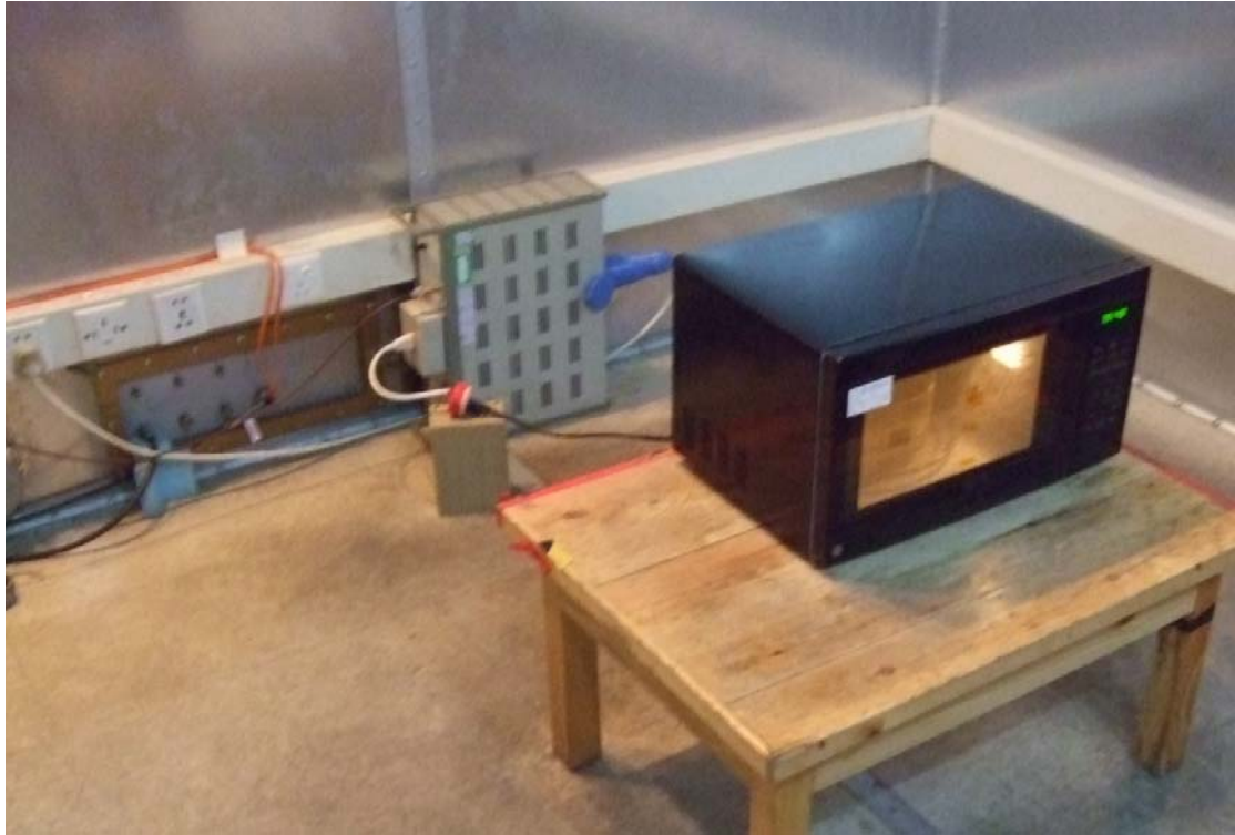
Conducted Emission Test Set-up