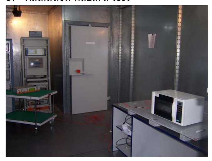
6. RF output power measurement