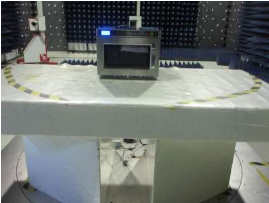
Radiated Disturbance above 9KHz-30MHz