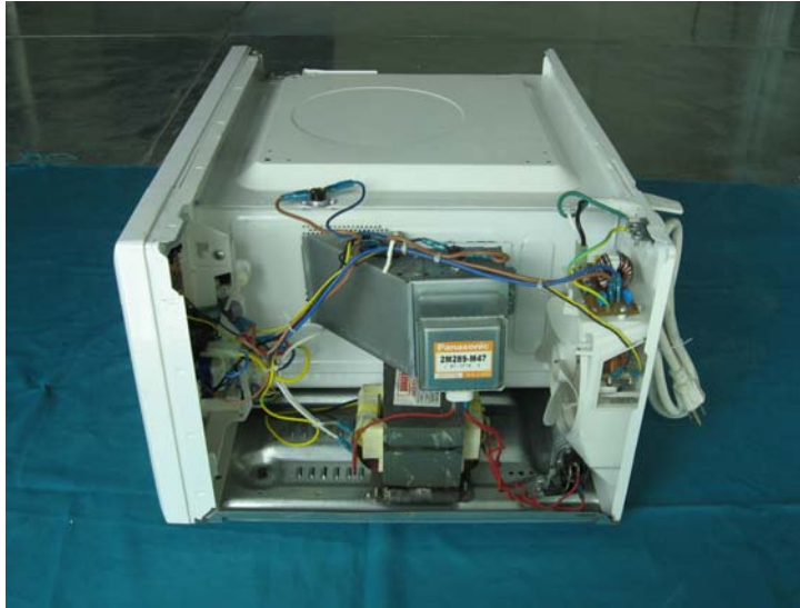
Photo 2- Front view of AC Power filter board