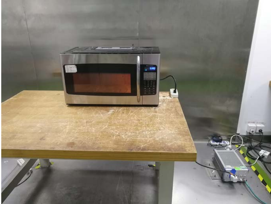
Conducted Emissions - Side View