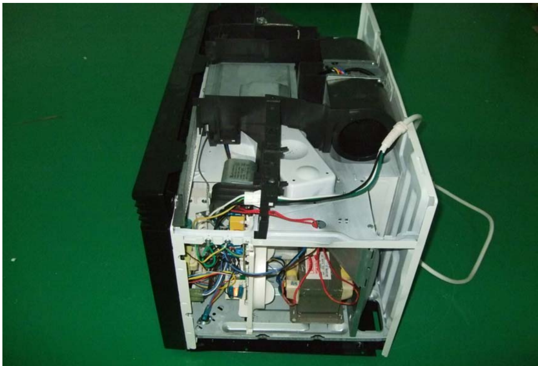
Uncovered View from right side