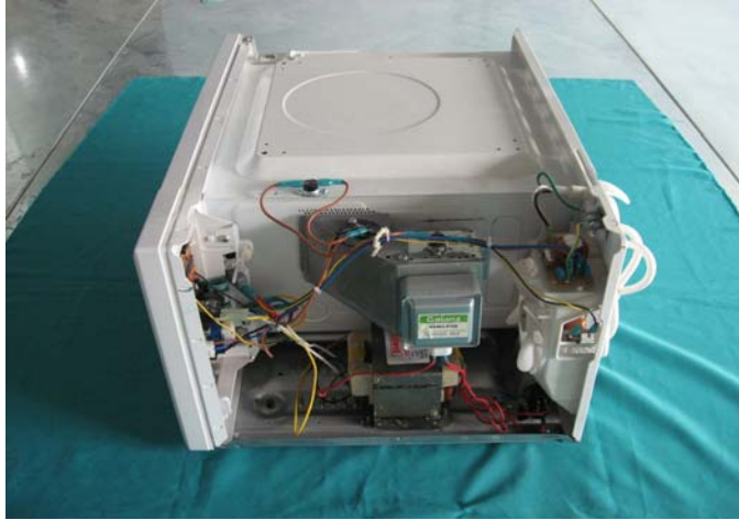
Photo 2- Front view of AC Power filter board