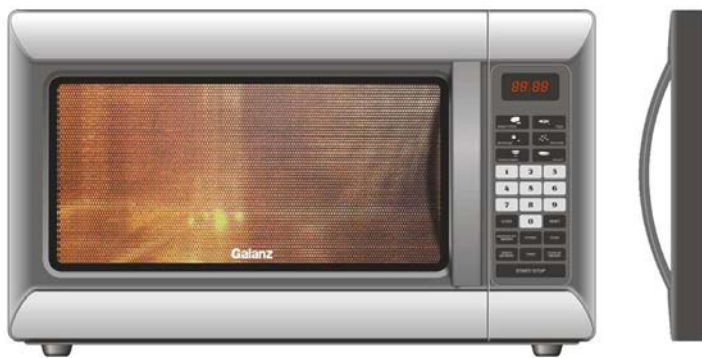
P100N30AL-MT1( 银 )