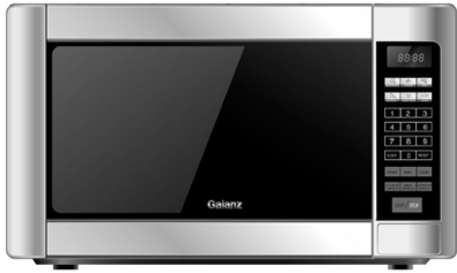
P100N30AP-F4( 银 ) P100N30AP-F4 详情