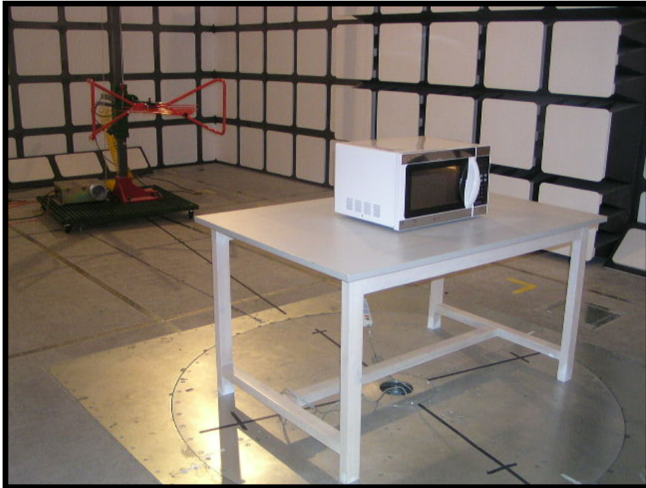
30 MHz to 1000 MHz: Radiated Emission - Rear View