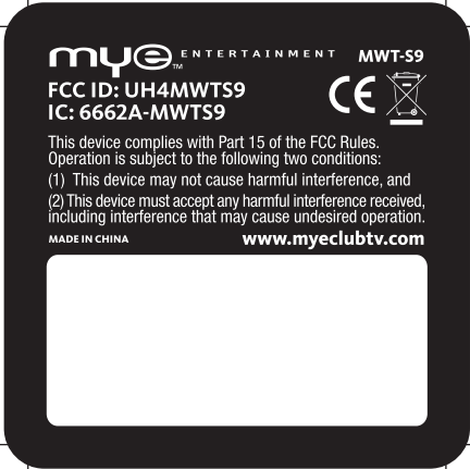
LABEL FOR 900MHZ