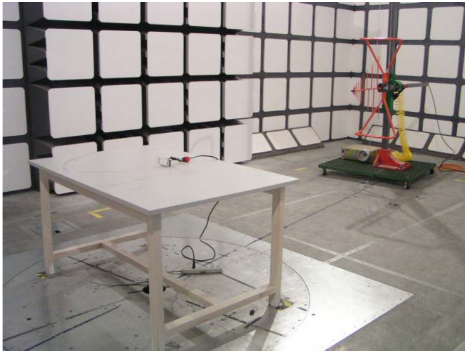
Radiated Emissions - Rear View (30 MHz - 1 GHz)