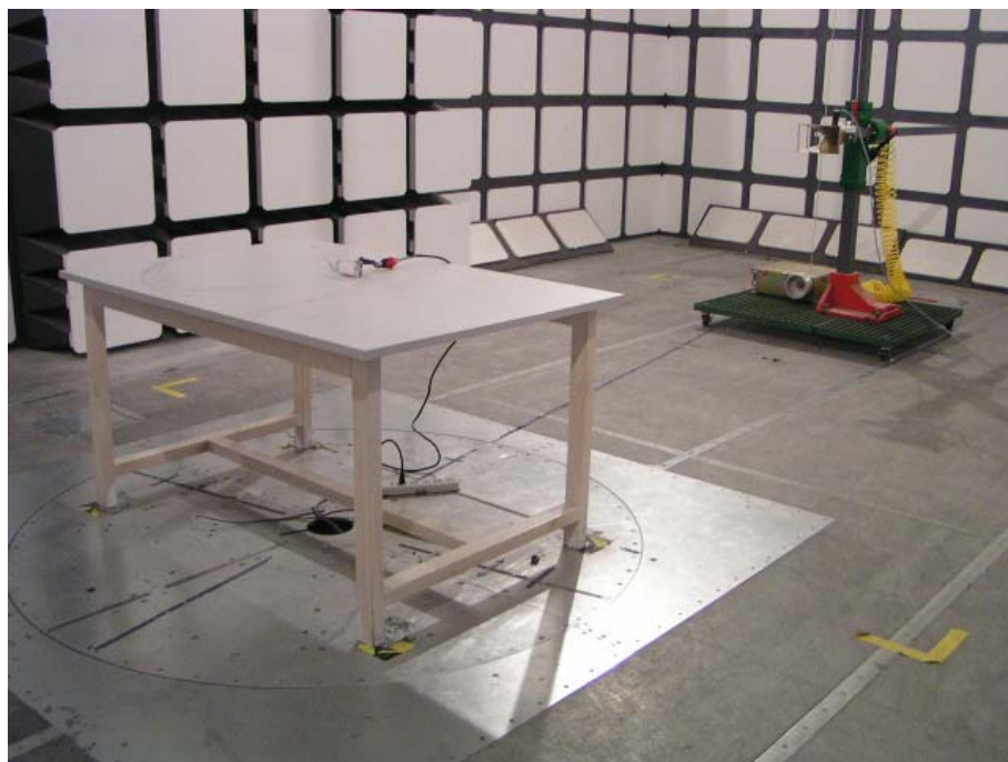
Radiated Emissions - Rear View (Above 1 GHz)