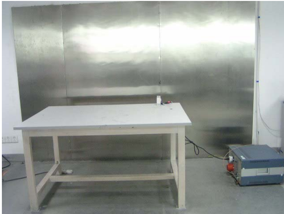
Conduction Emissions – Rear View