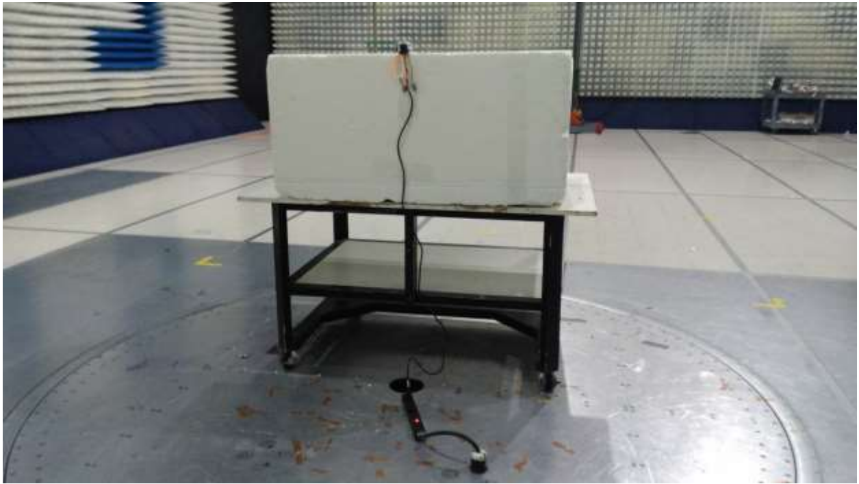
X - Axis