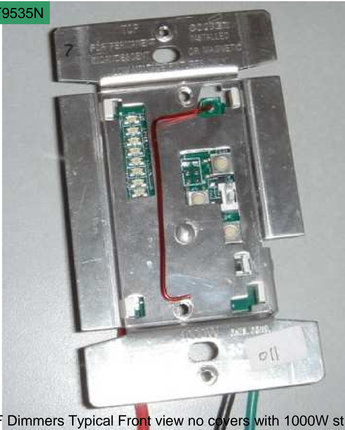
RF Dimmers Typical Front view no covers with 1000W strap