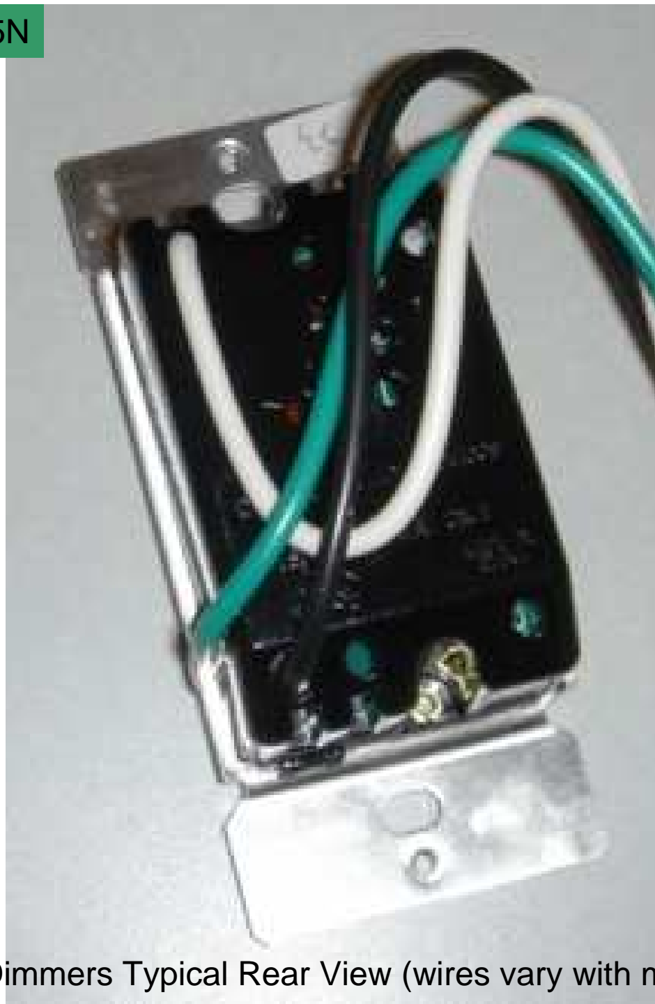
RF Dimmers Typical Rear View (wires vary with model)