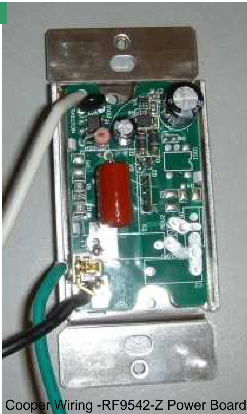
Cooper Wiring -RF9542-Z Power Board