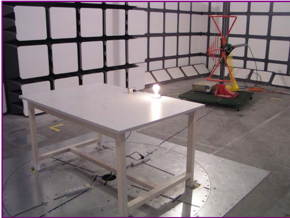
Radiated Emissions - Rear View (30 -1000 MHz)