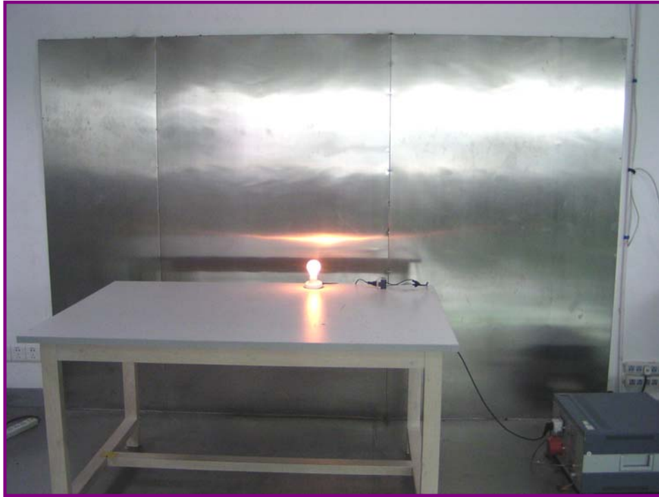
Conducted Emissions – Rear View