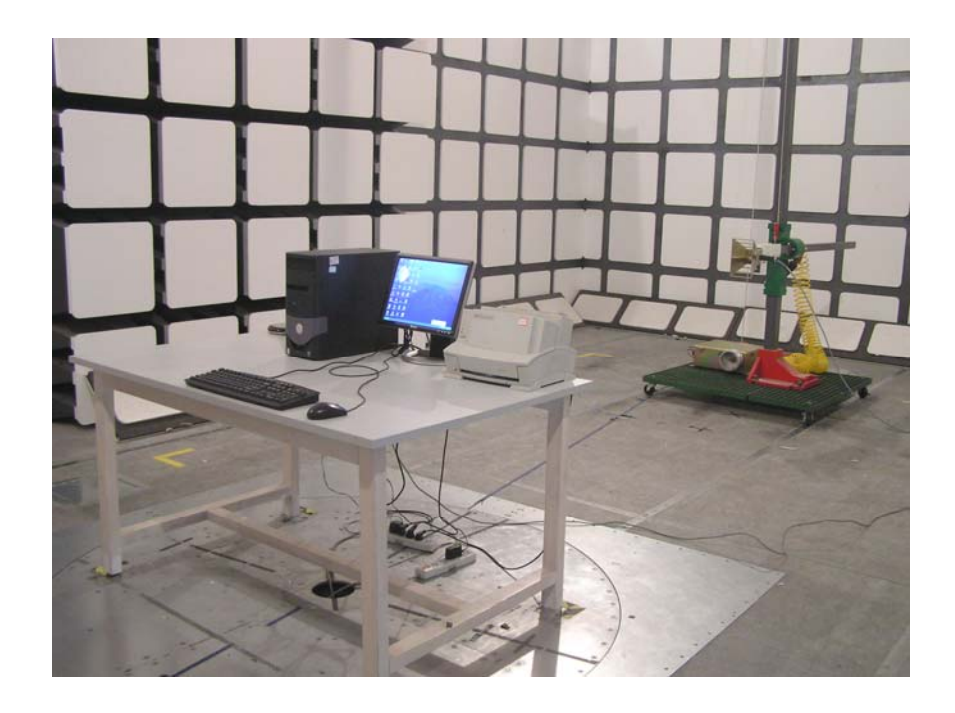
Radiated Emission - Rear View (Above 1000MHz)