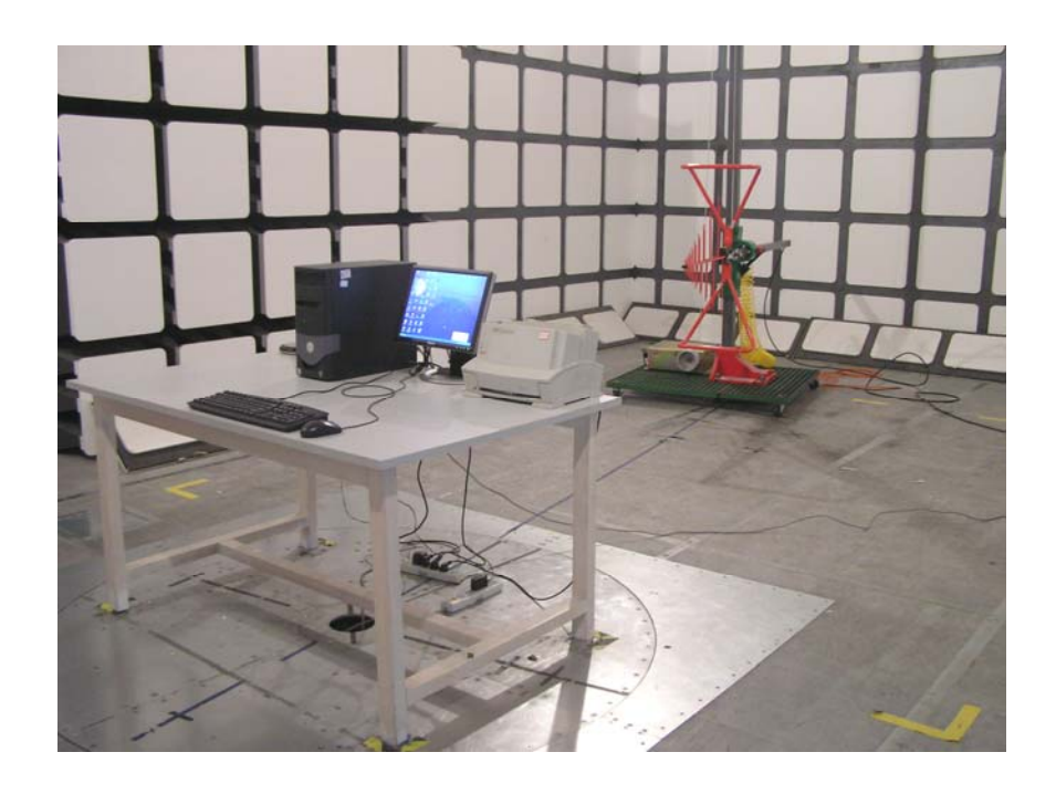
Radiated Emission – Rear View (30-1000MHz)