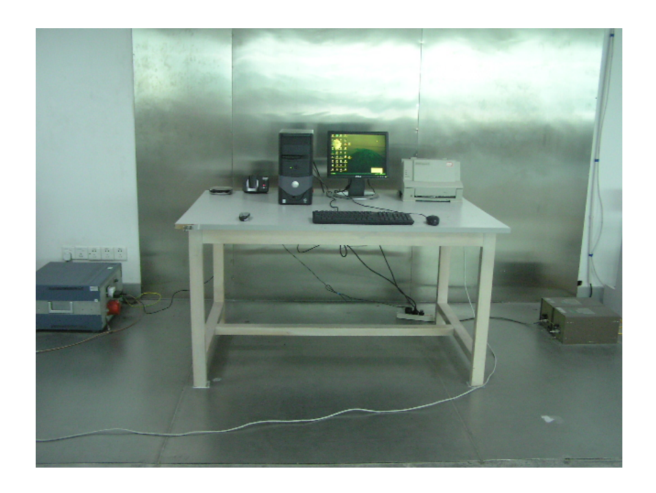
Conducted Emission - Rear View