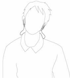
when talking/listening to music