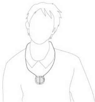
When carrying the headset

You can experience innovative portability thanks to Ubixon's patent technology.