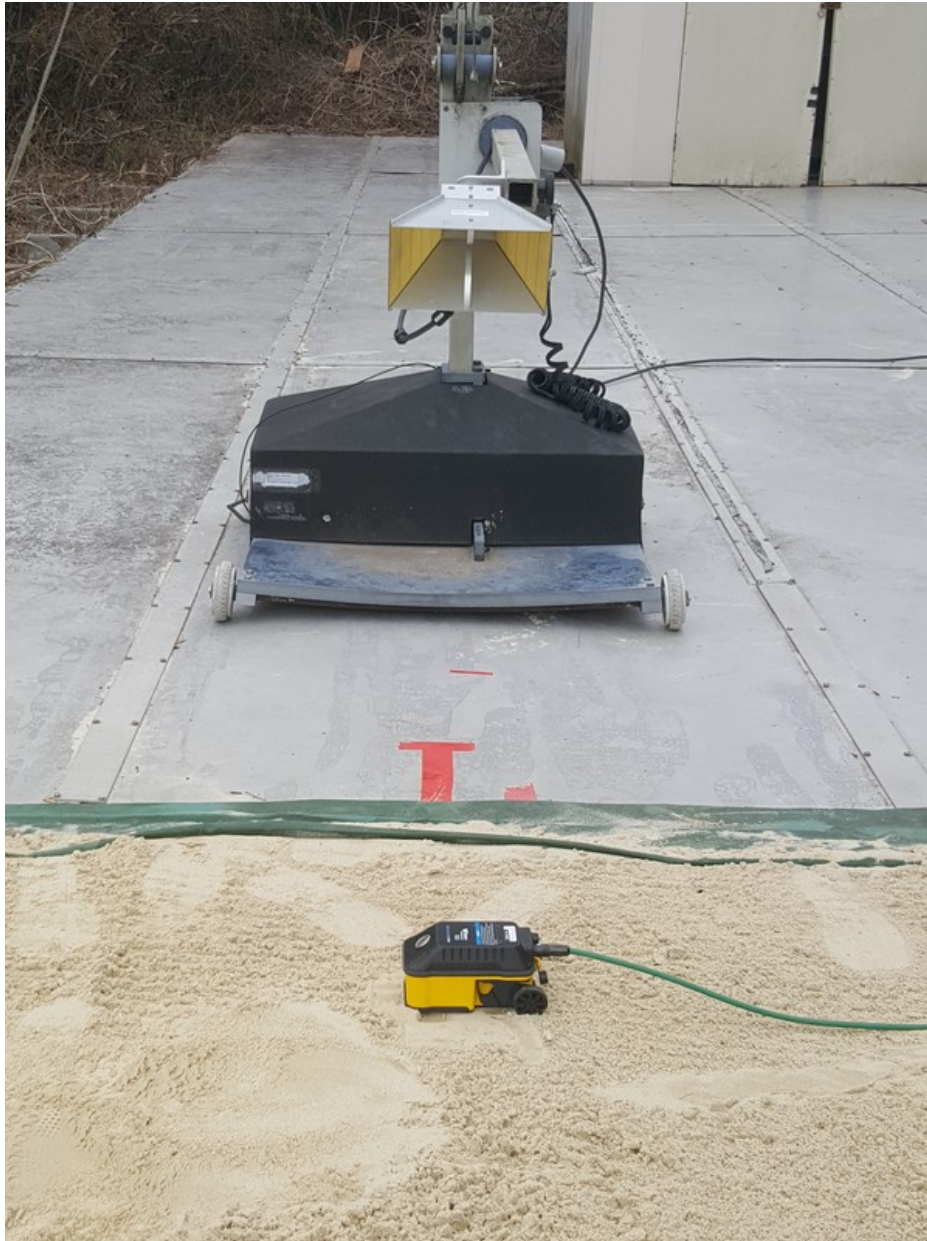
Above 1GHz ( 1m measurement for low emission signals)