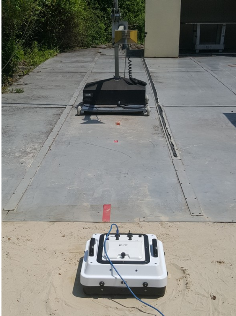
Above 1GHz ( 1m measurement for low emission signals)