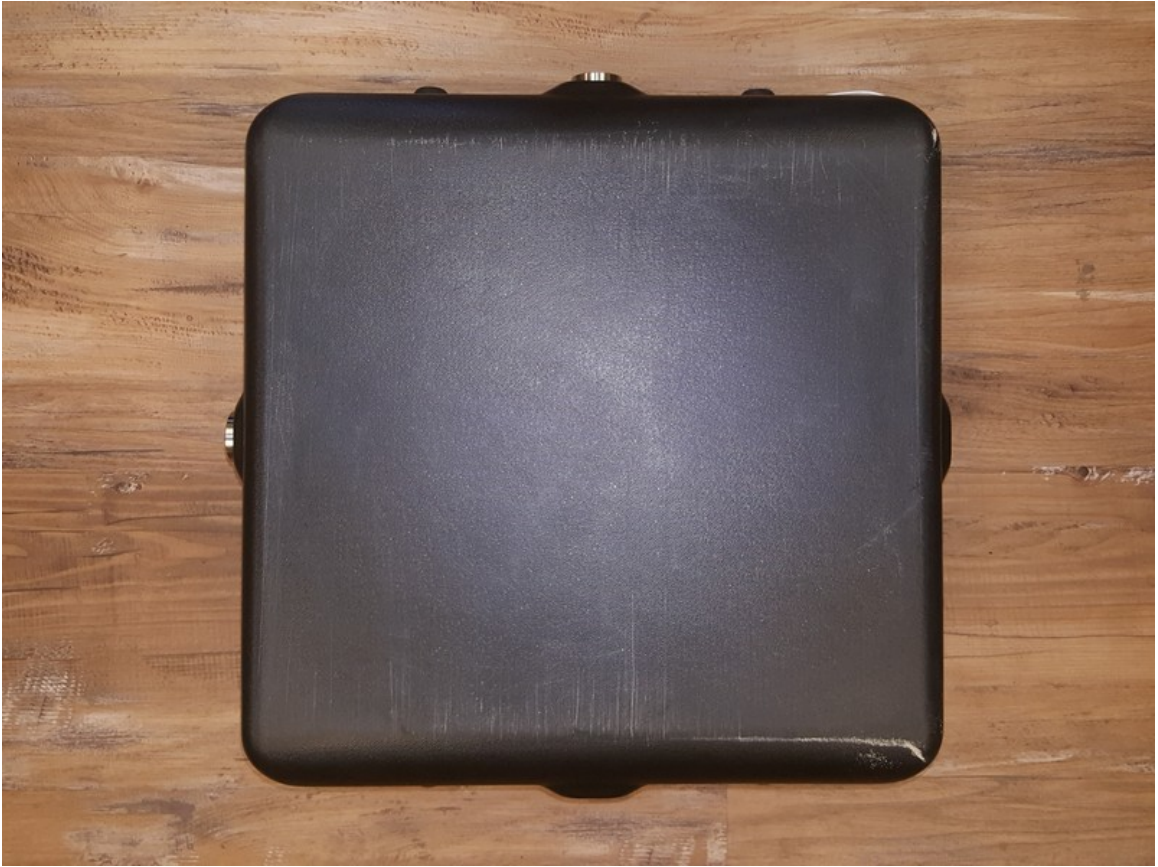
EUT Bottom View