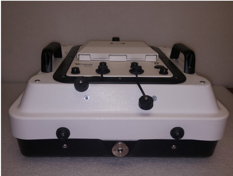
EUT Front Side View