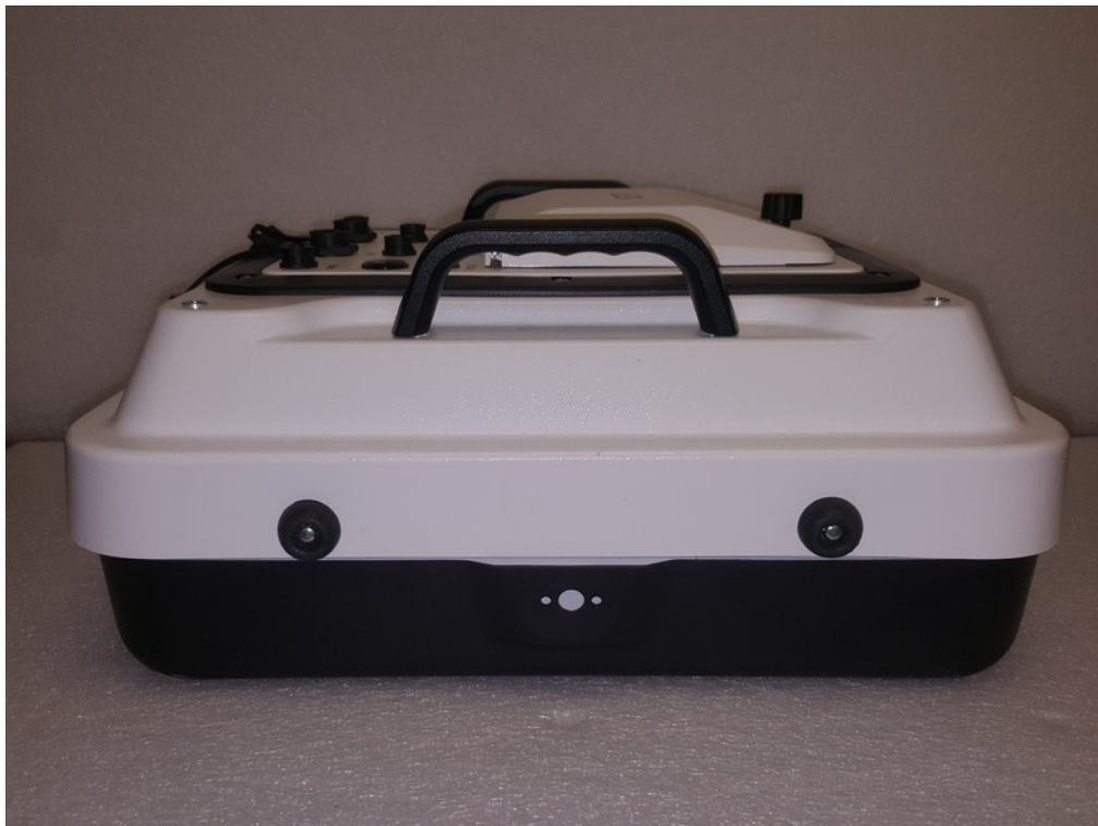
EUT Left Side View