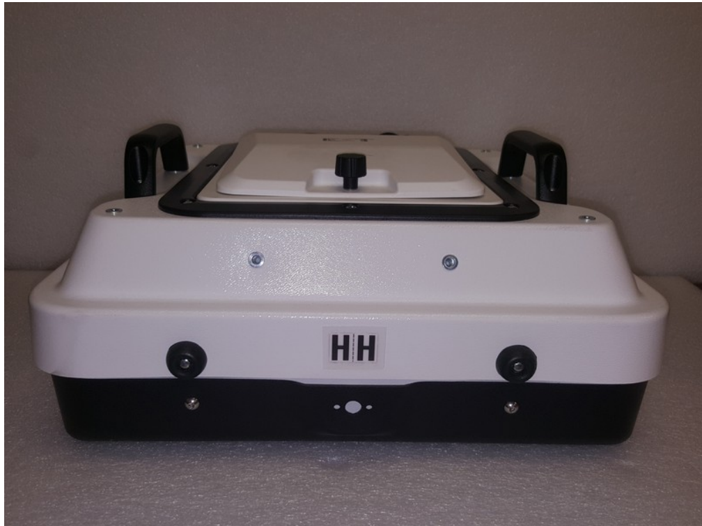
EUT Back Side View