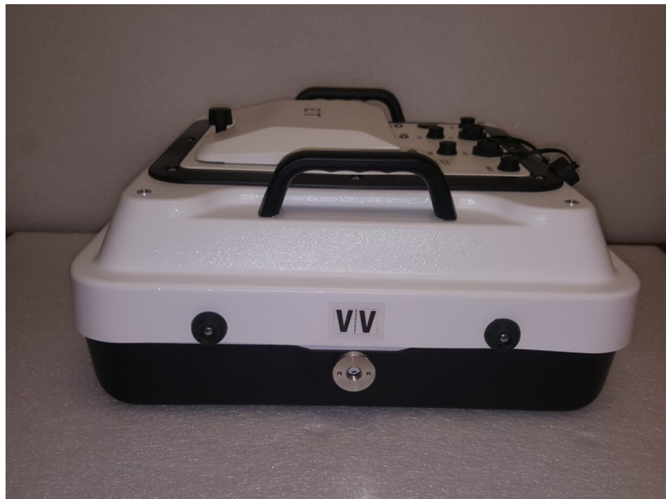
EUT_ Right Side View