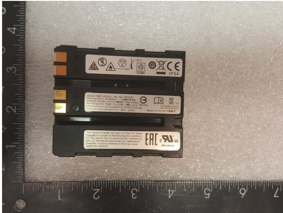
Rechargeable Battery View

----Internal Photos shall be provided by Applicant (confidential)