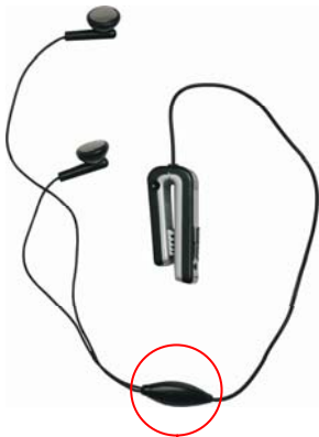
Inline Control: Bluetooth Control Button