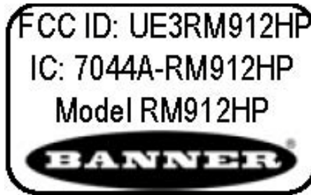
Photograph 1: ID Label Sample for Module