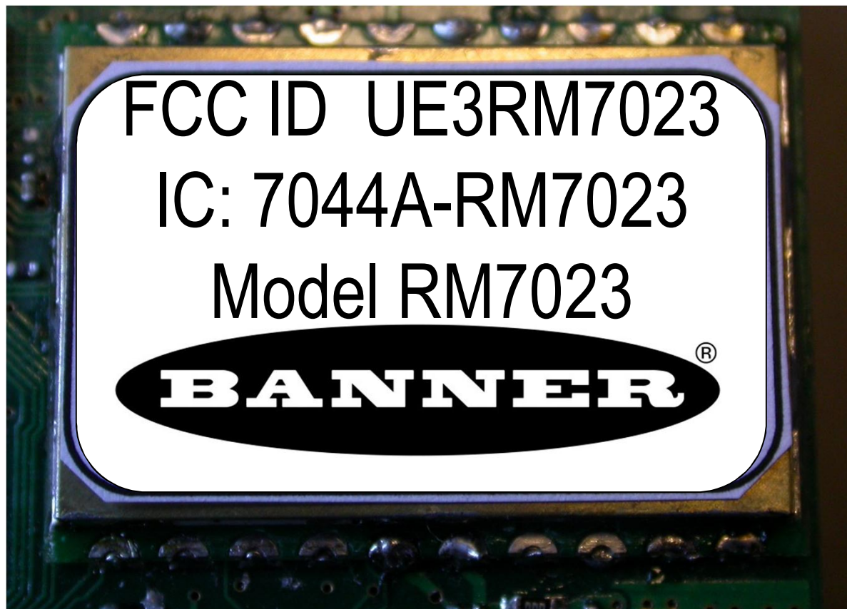
Photographic mock-up of label for RM7023 radio module, showing label in position on brass shield of the RM7023. Overall size: 0.6 x 1.0+