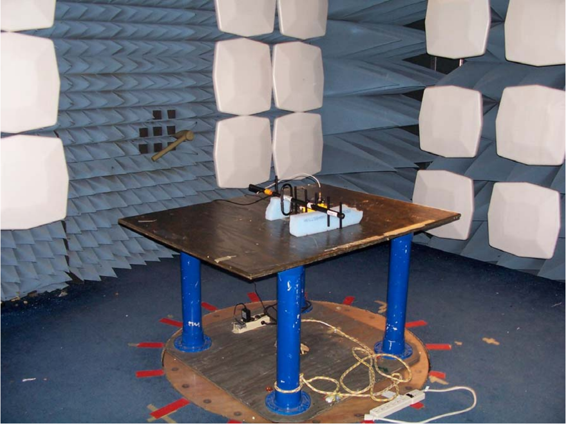
Figure 3 - Yagi