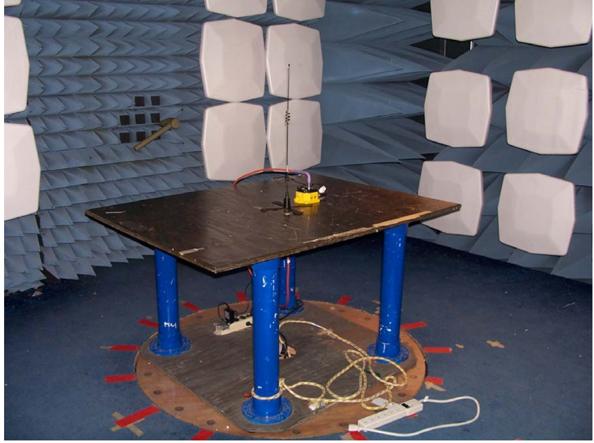
Figure 1 - 7 dBi Monopole