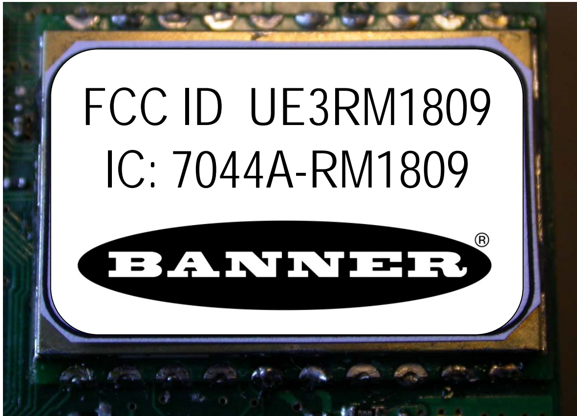
Photographic mock-up of label for RM1809 radio module, showing label in position on brass shield of the RM1809. Overall size: 0.6 x 1.0"