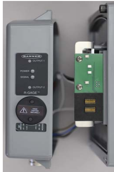
Figure 14, Assembly Side View