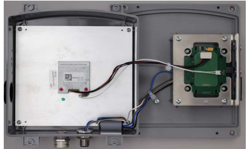
Figure 13, Cable Connections