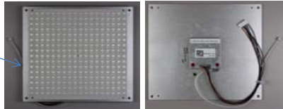
Figure 9, Tranceiver/Thermistor Assy 177106