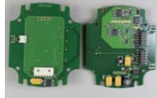
Figure 8, PCB Assy 184016