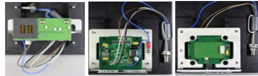
Figure 10, PCB Assy's on Bracket 181705