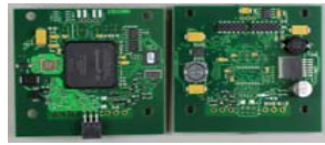
Figure 7, PCB Assy 156152