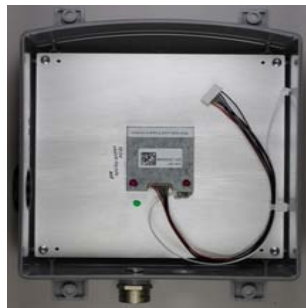
Figure 11, 182106 Cover w/ 177106