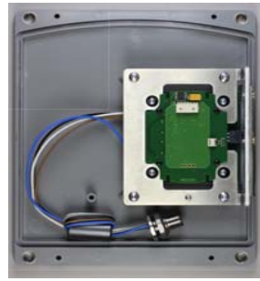
Figure 12, 182107 Base w/ PCB Assy's