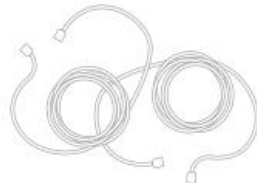
CAT5 Ethernet Cables