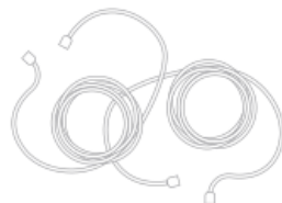
CAT5 Ethernet Cables