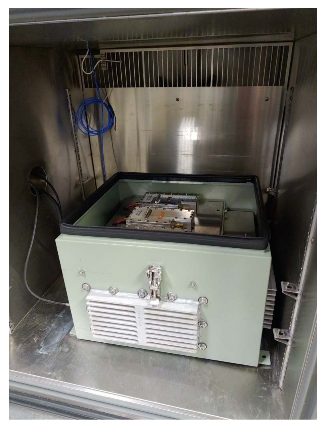
Figure E24.7 – Setup – Frequency Stability Measurements