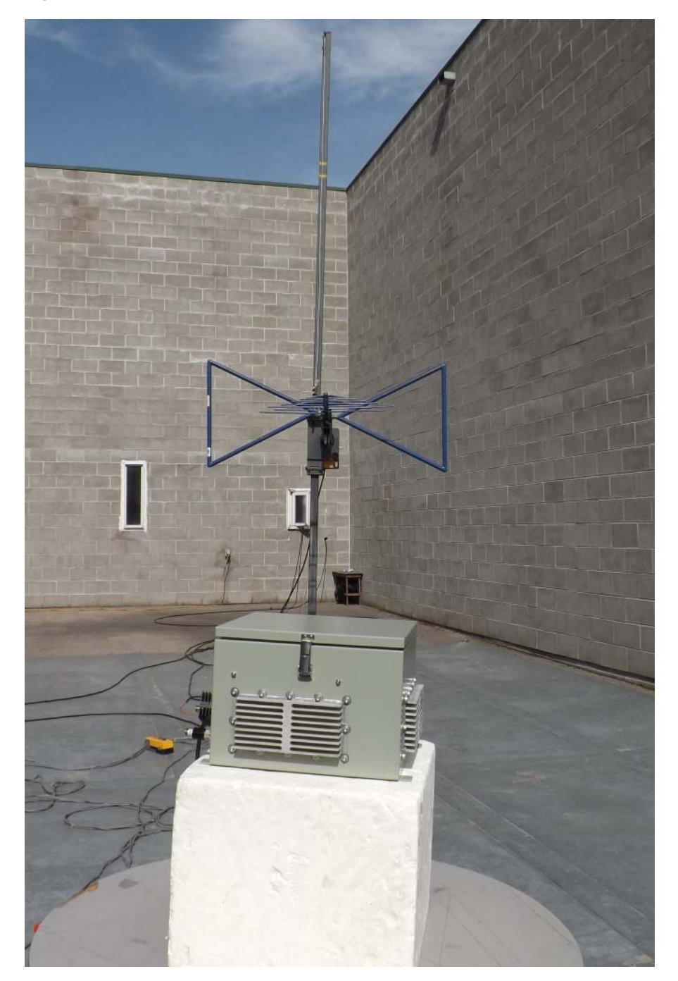
Figure E24.2 – Setup – Radiated Measurements – Below 1GHz