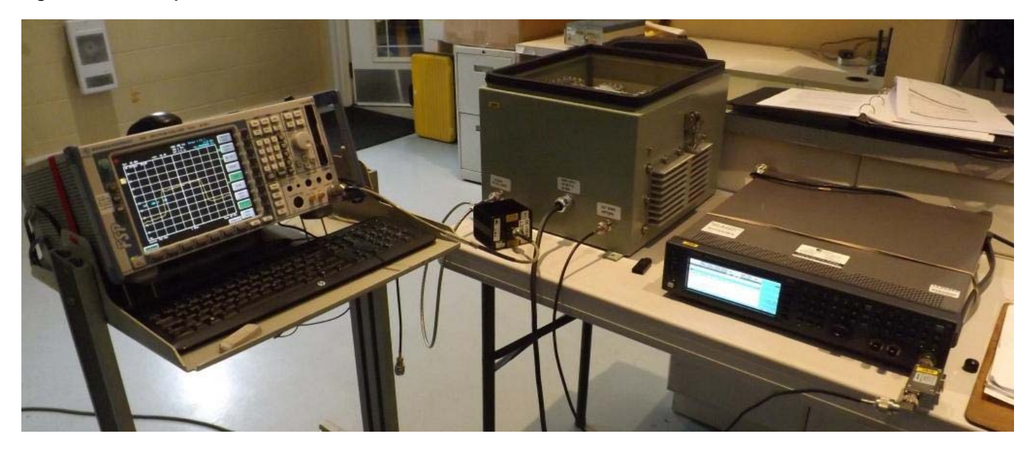
Figure E24.1 – Setup – Conducted Measurements