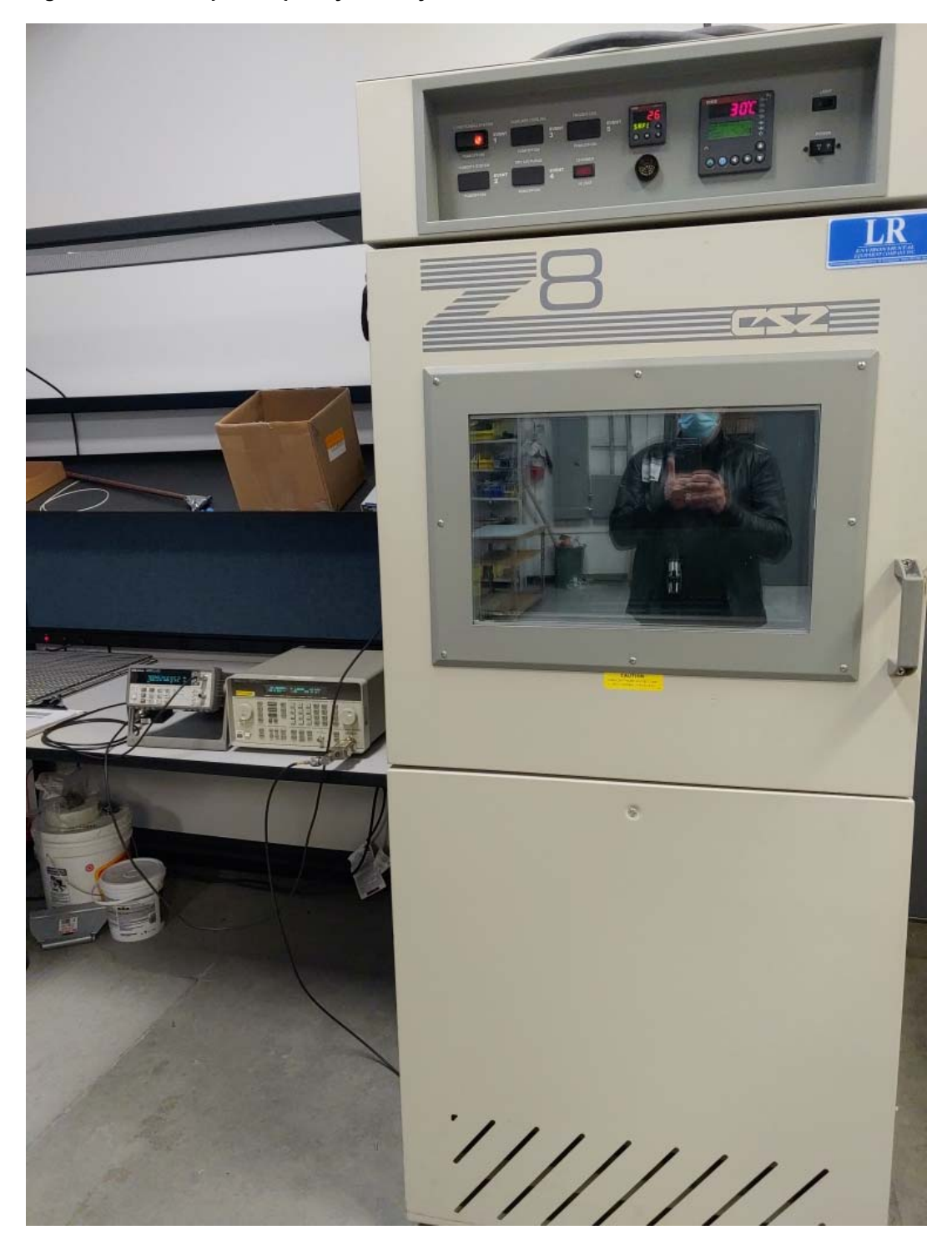
Figure E24.6 – Setup – Frequency Stability Measurements