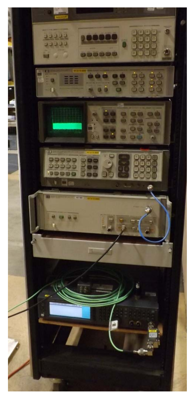
Figure E24.5 – Setup – Power Line Conducted Measurements