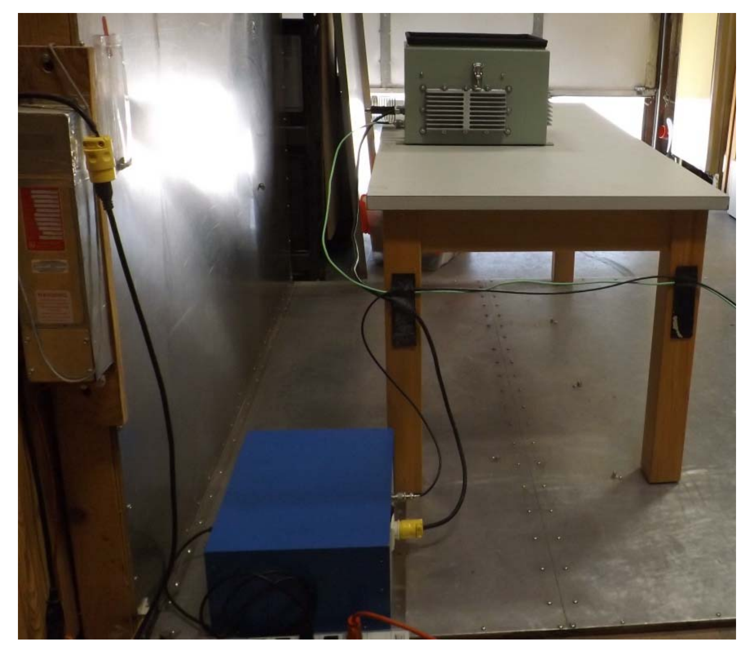
Figure E24.4 – Setup – Power Line Conducted Measurements