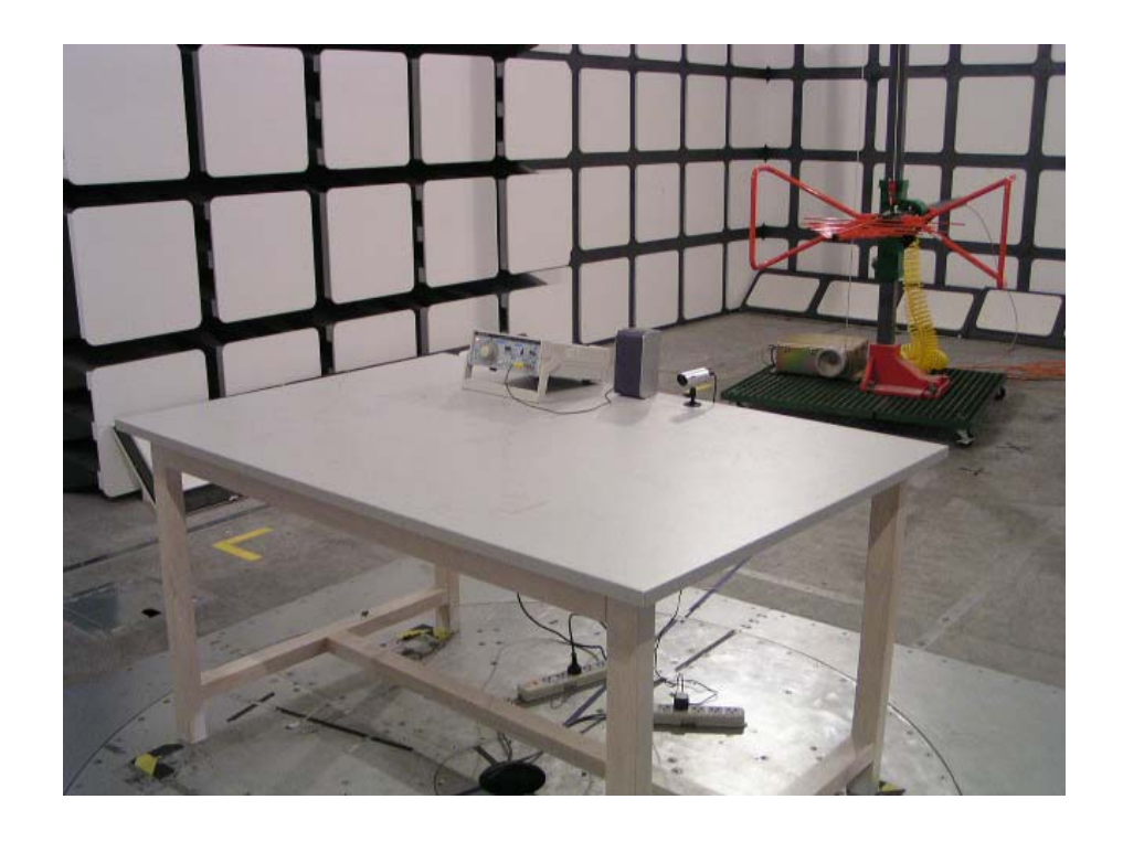
Radiated Emissions-Rear View (30-1000 MHz)