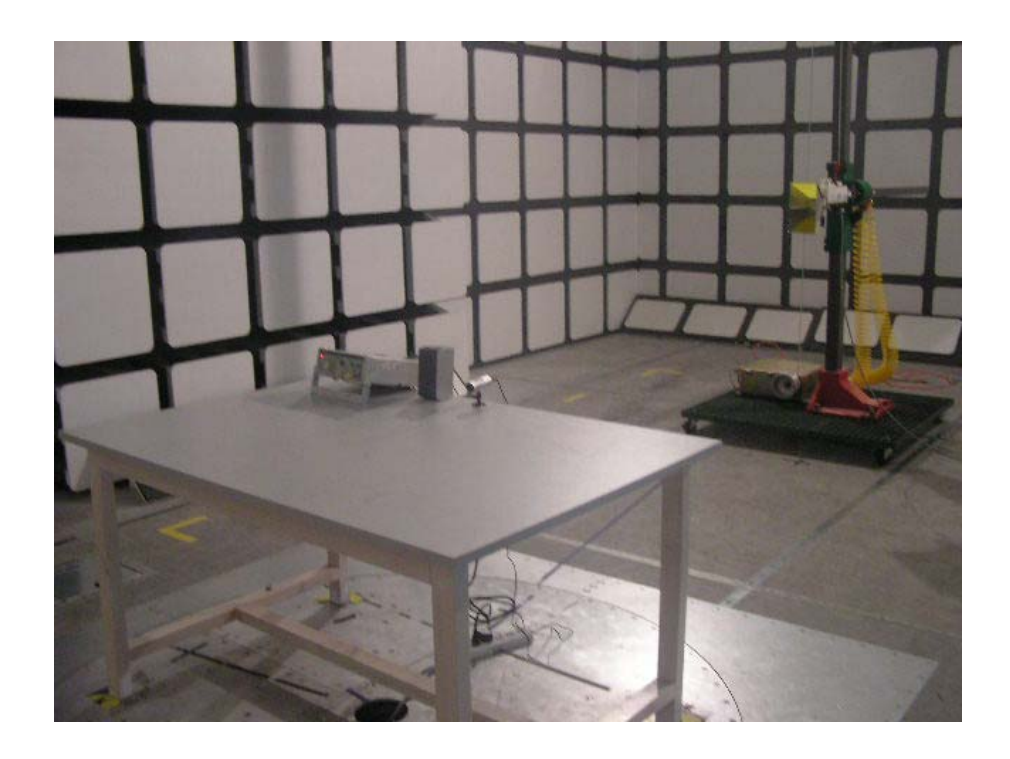
Radiated Emissions-Rear View (above 1GHz)