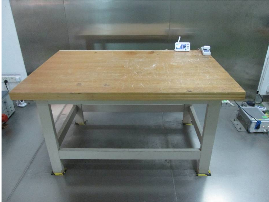
Conduction Emissions - Side View