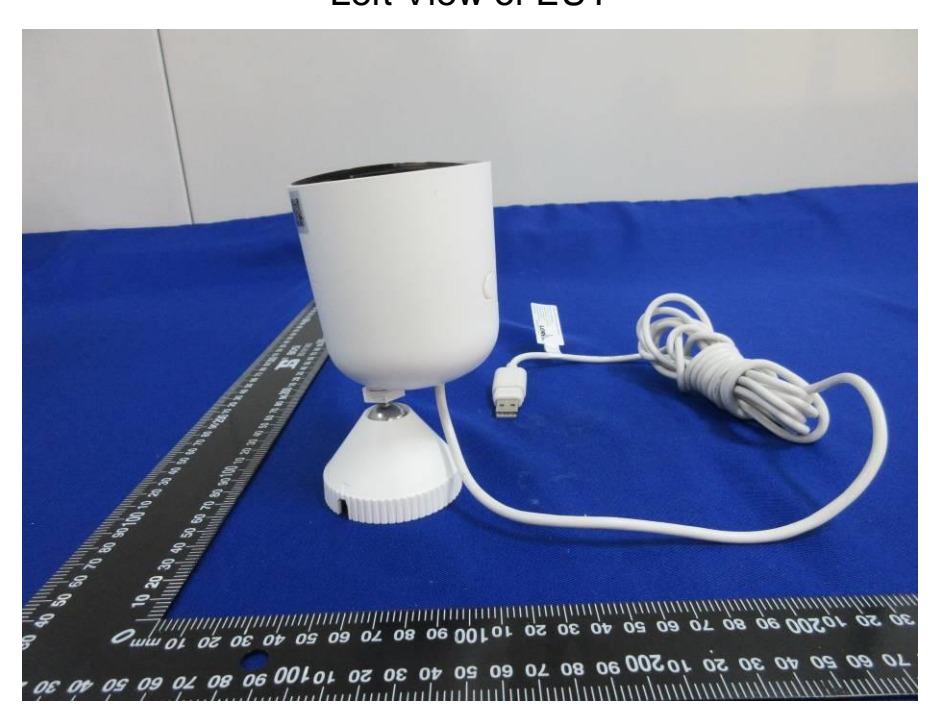
Right View of EUT