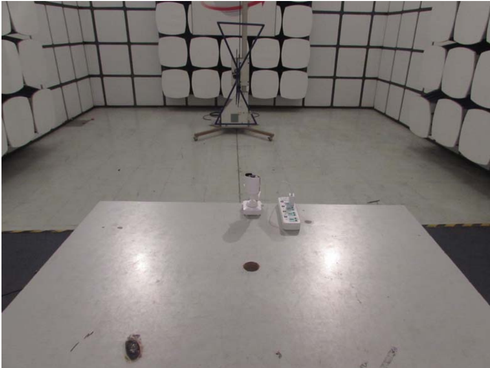
Radiated Test (1000-25000 MHz)