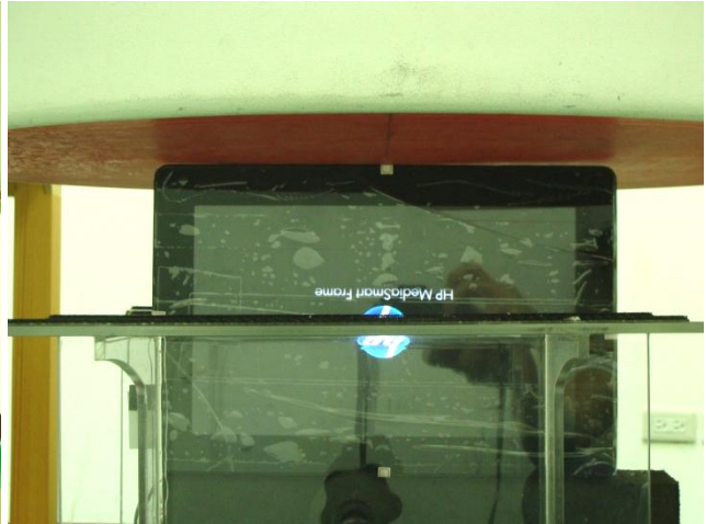
Bottom of the DUT with Phantom 0 cm Gap