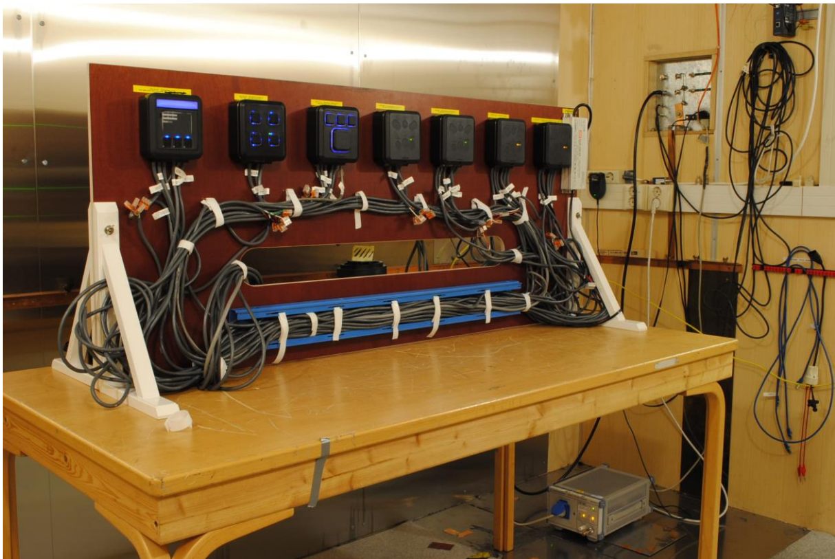
Power line Conducted Emissions Test