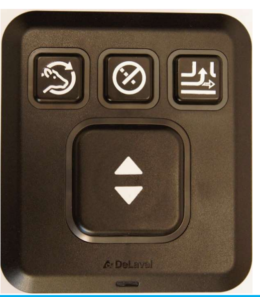
IOM200 / IOM400 / CCM215