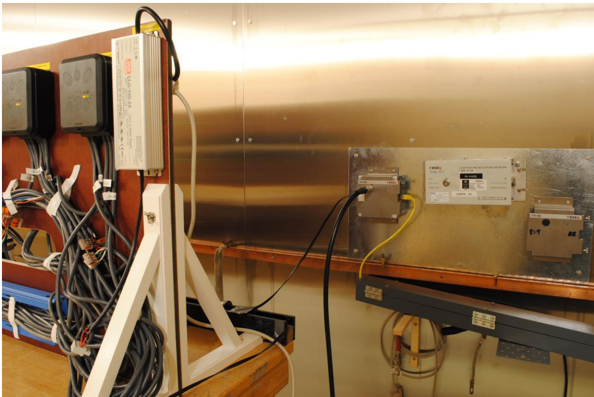
Power line Conducted Emissions Test