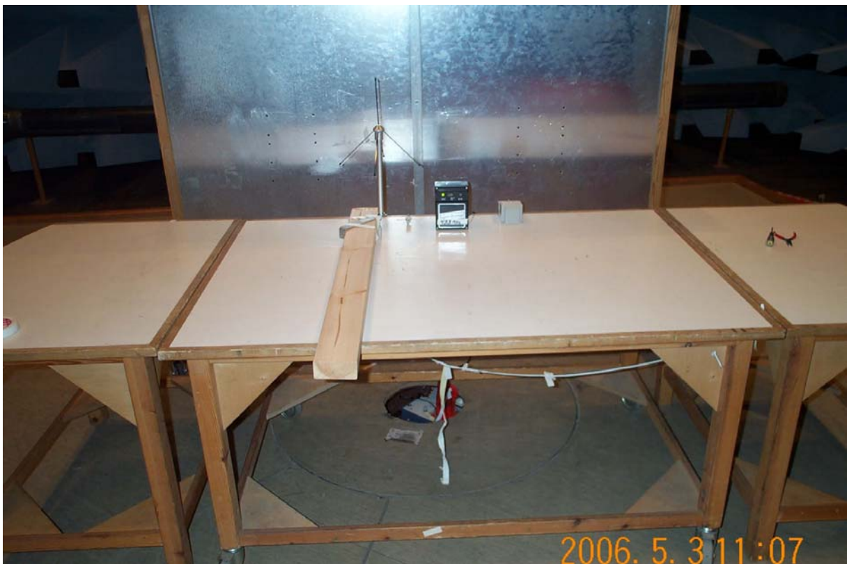
Photo A2.4 Test setup for conducted emission.