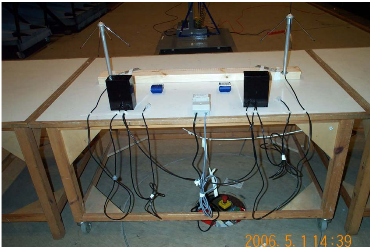
Photo A2.2 Units during emission tests (See Section 3.1 for details of setup).