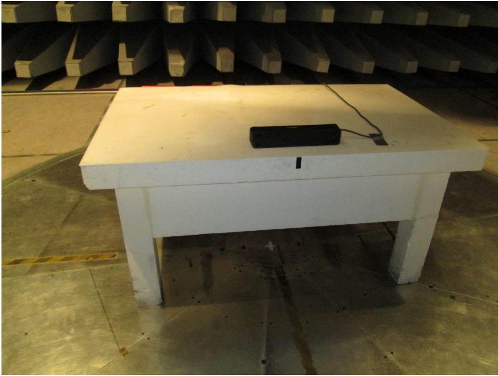
Photo 2.2.1 Test setup regarding measurement of radio frequency electromagnetic field. Preview measurement in shielded room