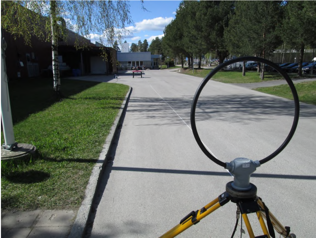
Photo 2.2.3 Test setup regarding measurement of radio frequency electromagnetic field. Verification measurement outdoors. 30 m measurement distance.