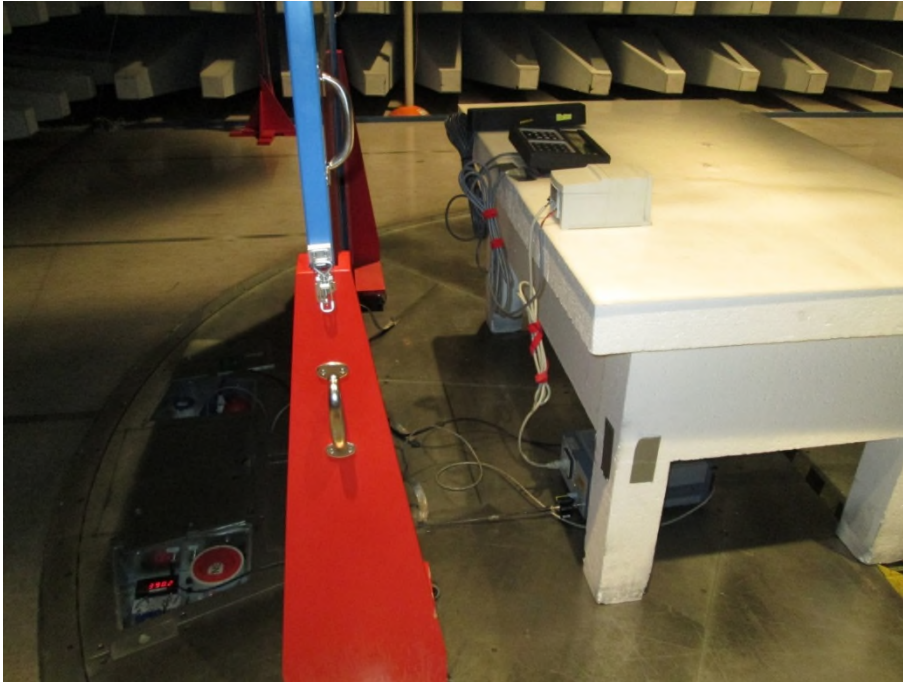
Photo 2.1.1 Test setup regarding measurement of radio frequency voltage on mains.