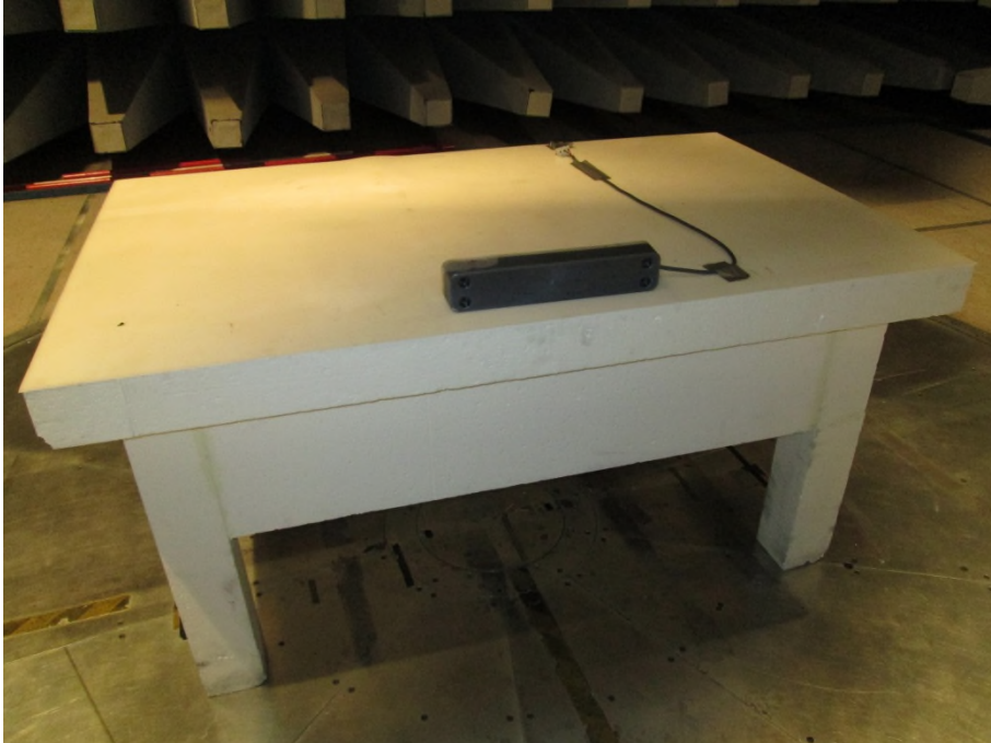
Photo 2.3.1 Test setup regarding measurement of radio frequency electromagnetic field.