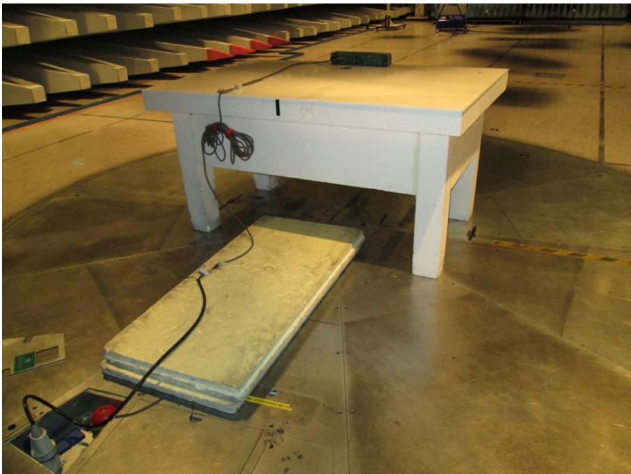
Photo 2.3.1 Test setup regarding measurement of radio frequency electromagnetic field.