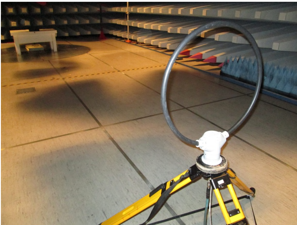
Photo 2.2.2 Test setup regarding measurement of radio frequency electromagnetic field. Preview measurement in shielded room