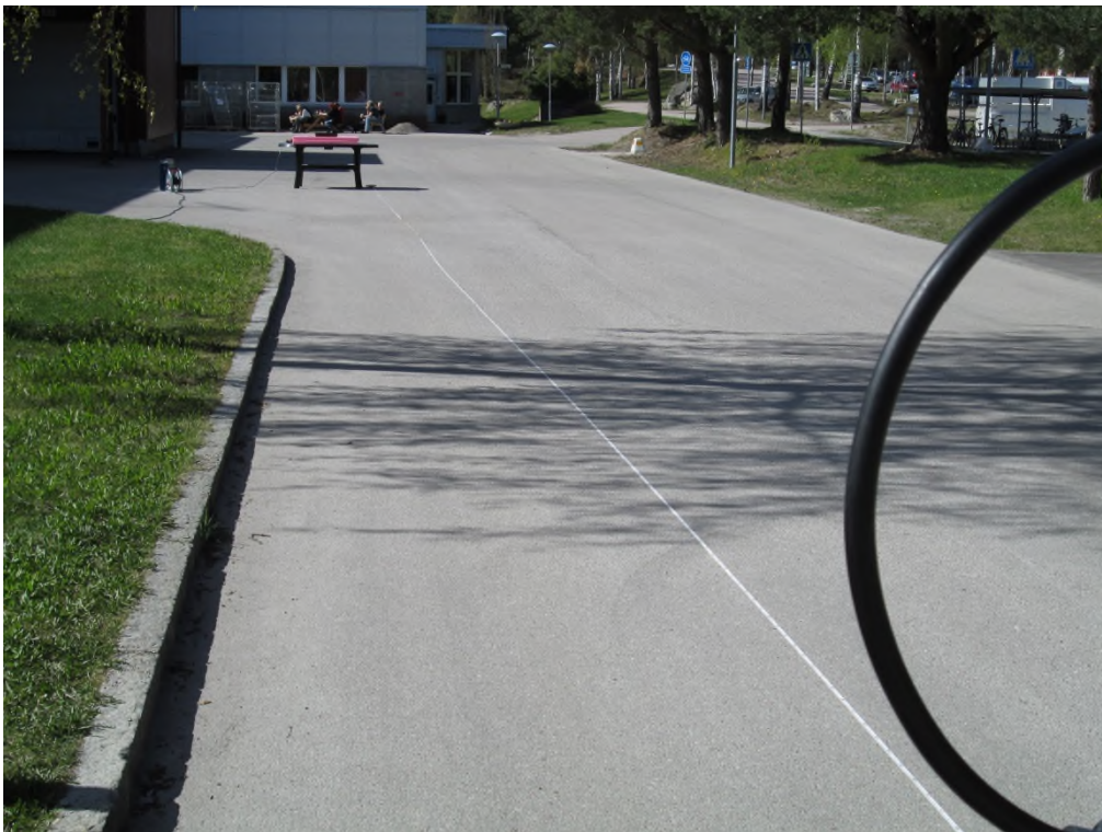
Photo 2.2.4 Test setup regarding measurement of radio frequency electromagnetic field. Verification measurement outdoors. 30 m measurement distance.