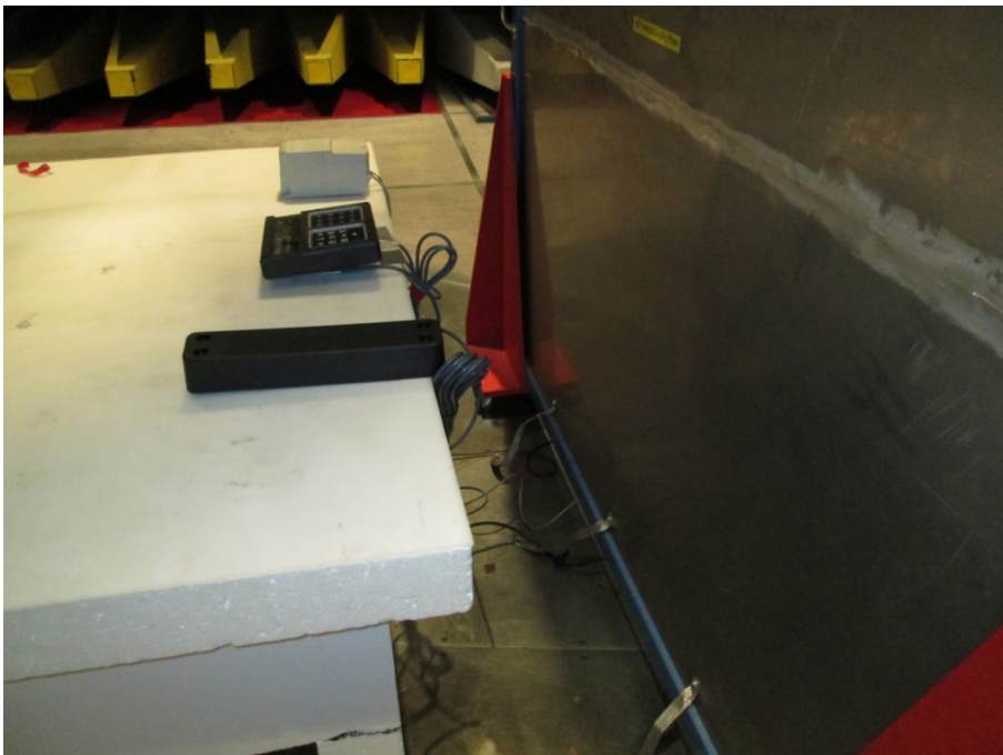
Photo 2.1.2 Test setup regarding measurement of radio frequency voltage on mains.