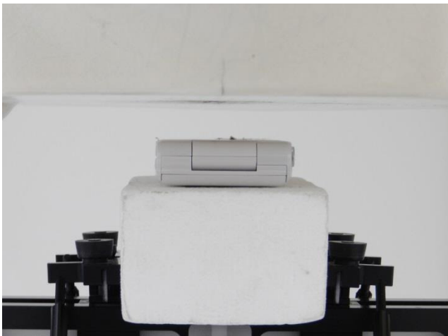
Front, Test Separation 15 mm