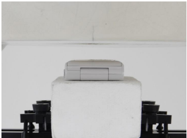
Back, Test Separation 15 mm