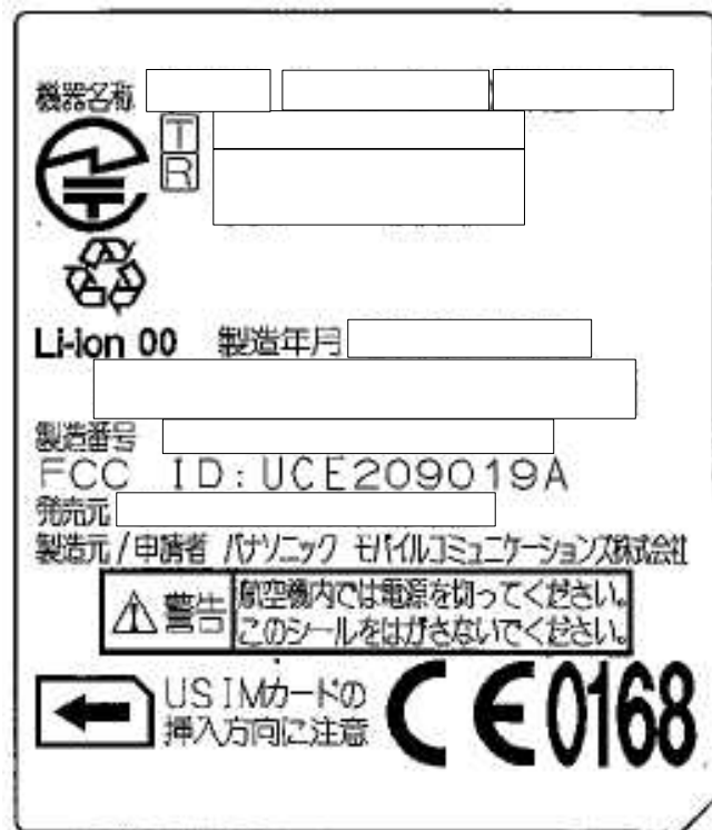
-FCC ID label

Model Name Color Commodity code Production Year & Month ID for JATE ID for TELEC Operator Name Bar Code of IMEI IMEI (Production Serial Number)