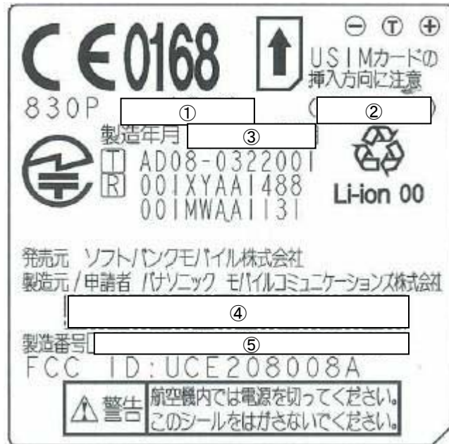
-FCC ID label