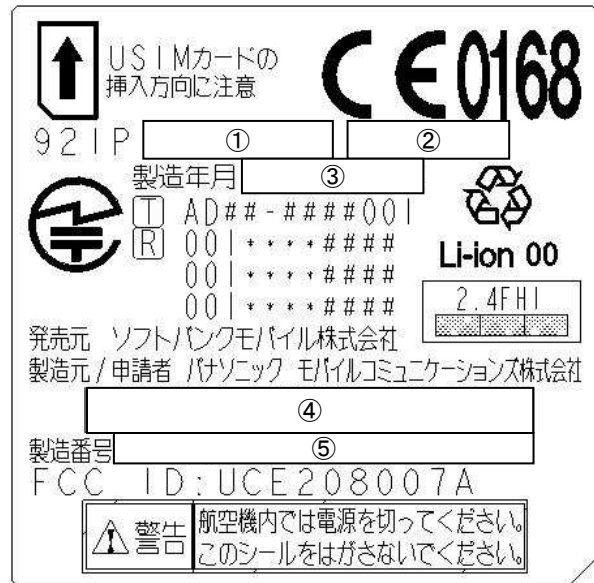
-FCC ID label