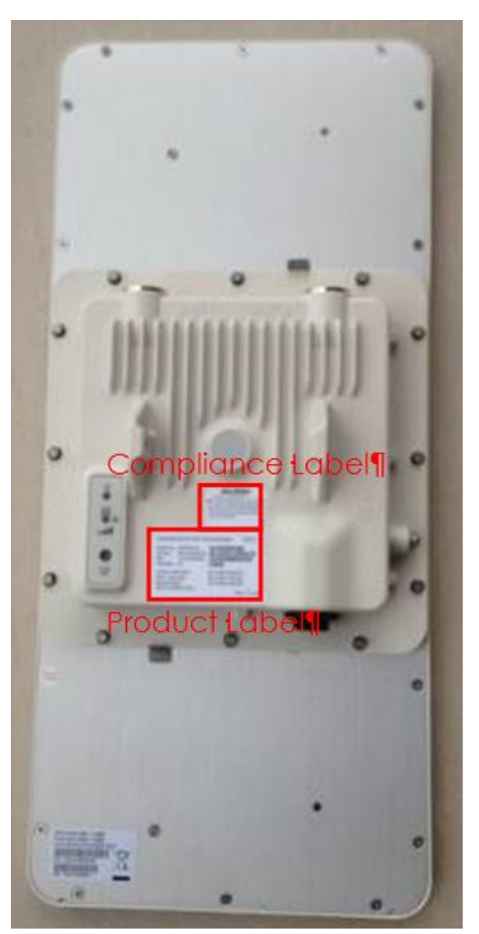
Product Label (50mm x 37mm)