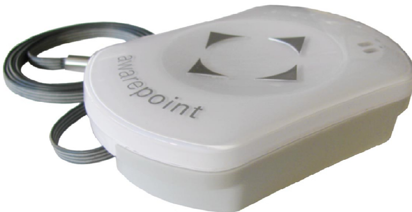
(This view is not at the same scale)