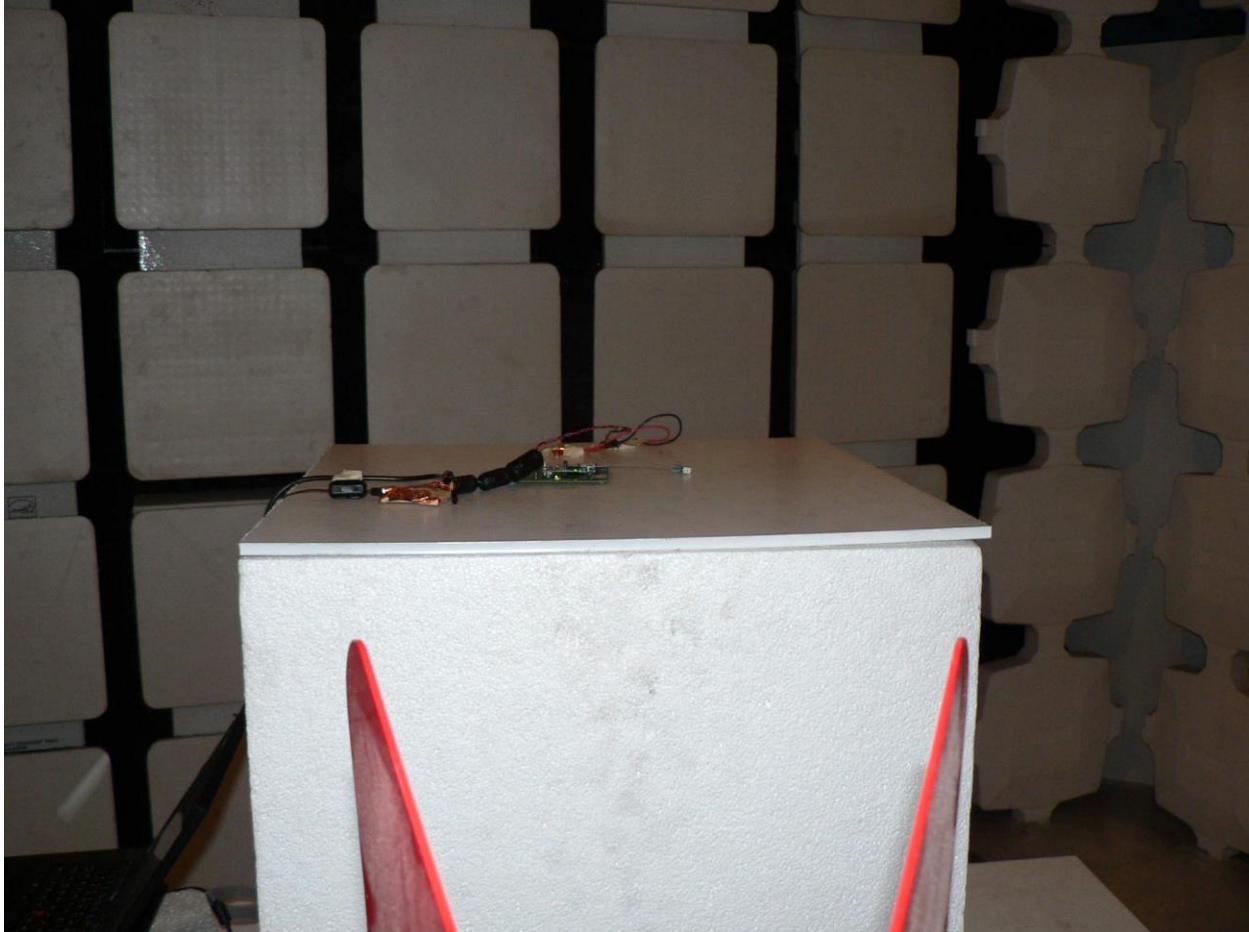
Camouflage TX Spurious 1-18GHz