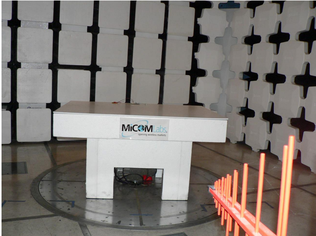
Camouflage Digital Emissions 30-1000MHz