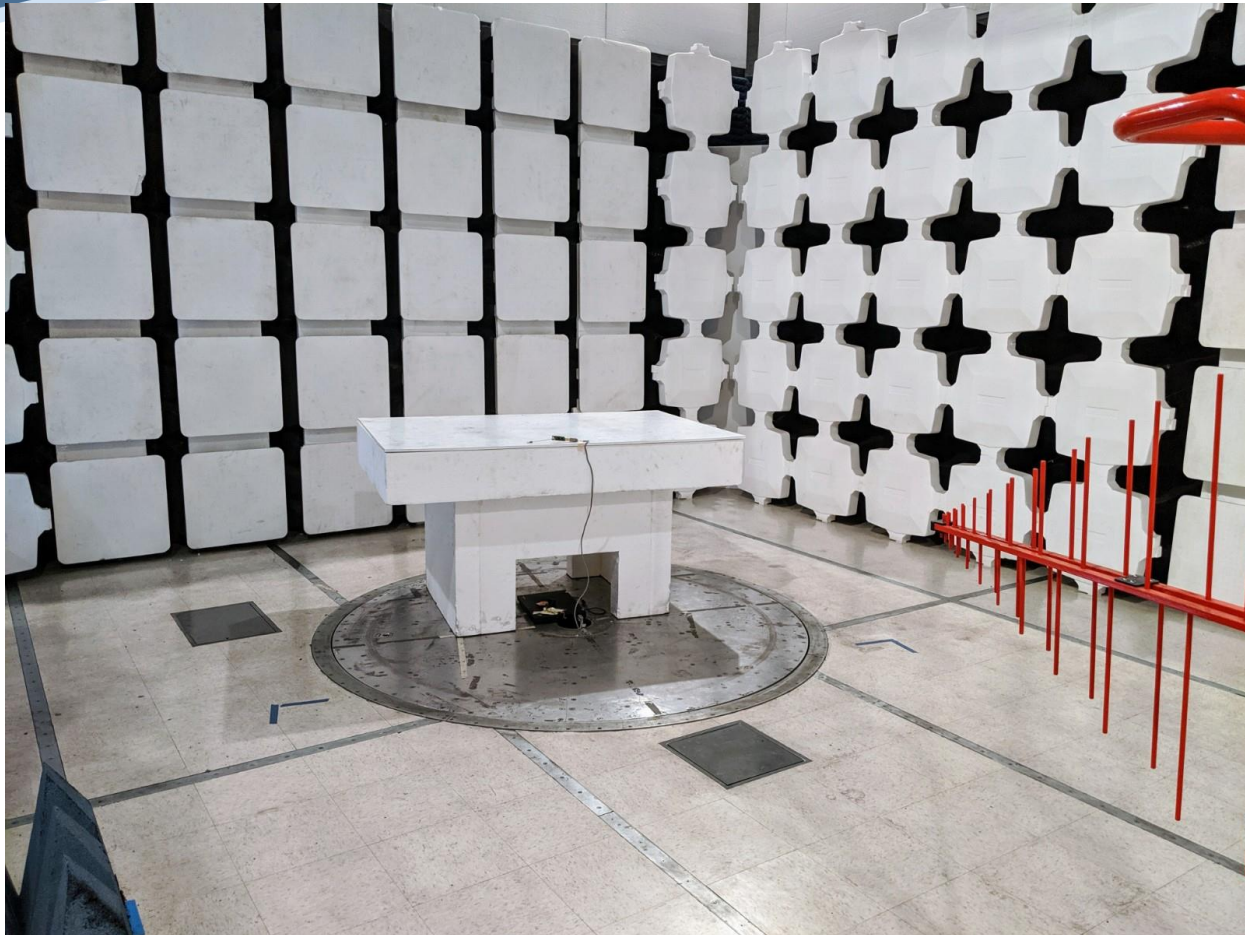
Emissions 30MHz - 1GHz