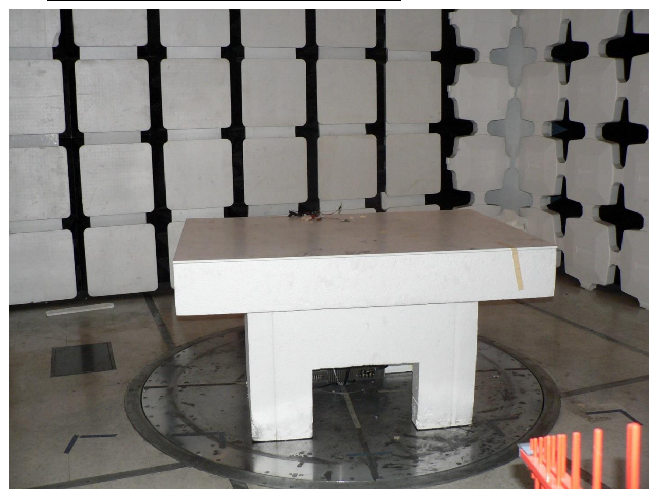
AL5833_Destroyer256 Digital Emissions 30-1000MHz