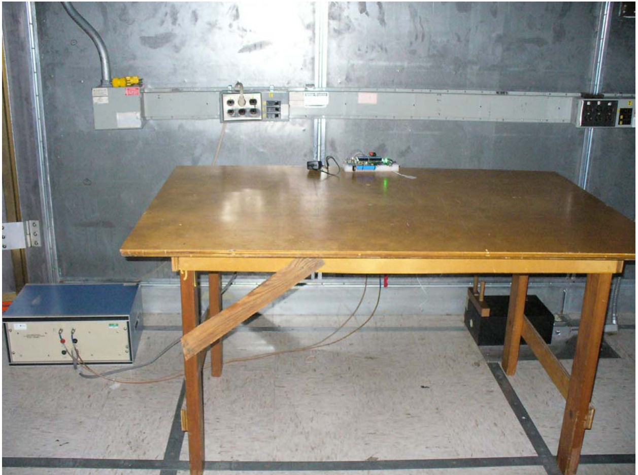
Figure 4: Powerline Conducted Emissions – Front View