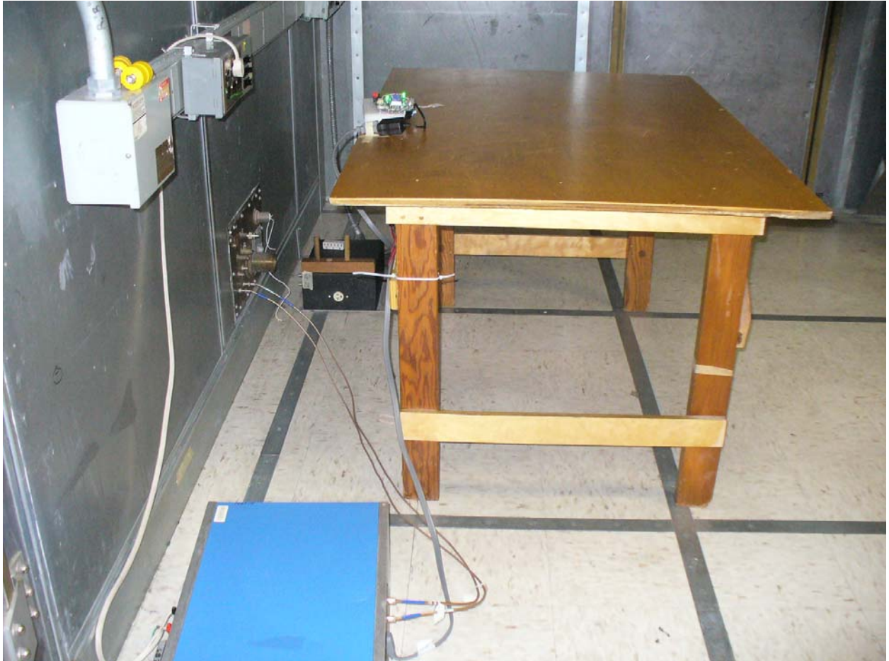
Figure 5: Powerline Conducted Emissions – Side View