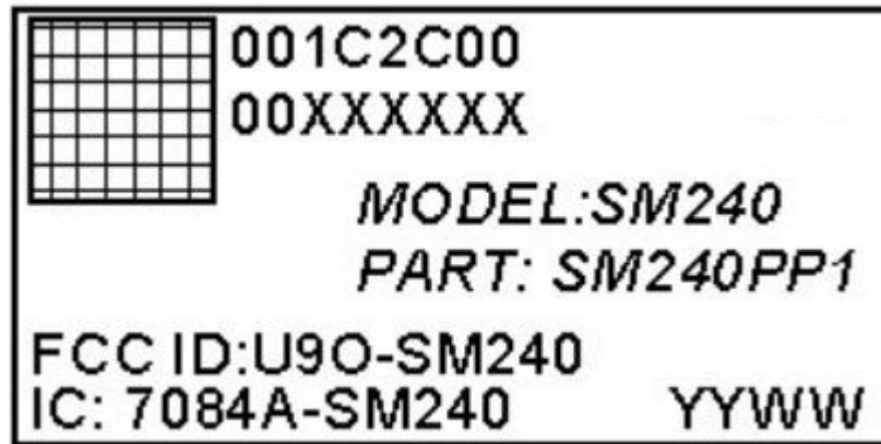
Figure 1: Sample Label